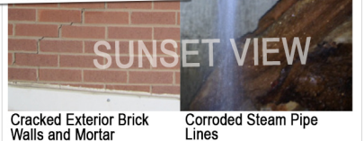
Cracked Exterior Brick Walls and Mortar