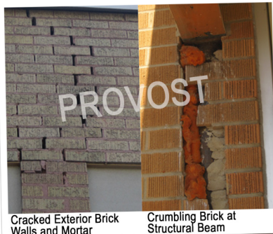
Cracked Exterior Brick Walls and Mortar