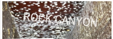
Moisture Damage to Floor Structure